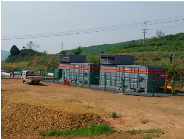
Coalbed methane compressors for Asian American Gas Inc 70000M3/D 320KW 380V motor driven 100000M3/D 420KW 6000V motor driven