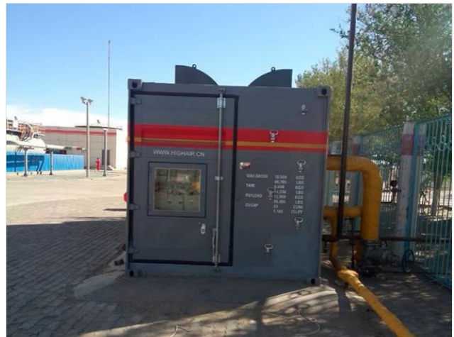
Coalbed Methane Compressors for CNPC 30000M3/D 220KW 380V motor driven

HIGH Air Company, as a reliable air compressor manufacturer in China, provides coalbed methane compressor, biogas compressor, PET compressor, and high pressure air compressor to choose from. With decades of experience in compressor production, our company can offer a variety of natural gas compressors and industrial compressors, as well as air compression solutions in client specific needs.