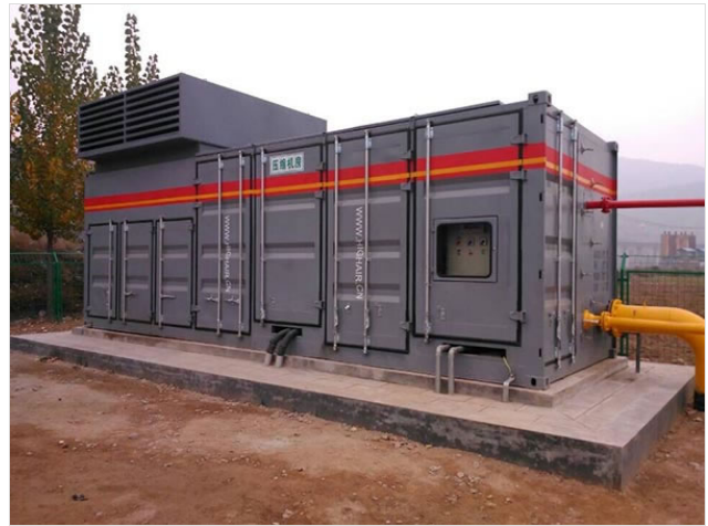
Coalbed methane compressors for Asian American Gas Inc 70000M3/D 320KW 380V motor driven 100000M3/D 420KW 6000V motor driven