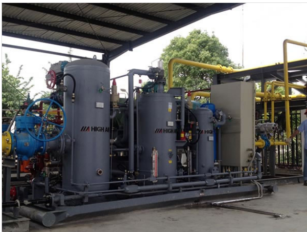
Water cooled natural gas compressors for cogeneration Inlet pressure 10PsiG, outlet pressure 30PsiG 60480M3/D 140KW Fuel gas boosting