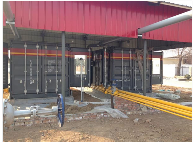
2 natural gas compressors for flare gas recovery Inlet pressure 3.6PsiG, outlet pressure 12PsiG 30000M3/D 220KW Gas gathering